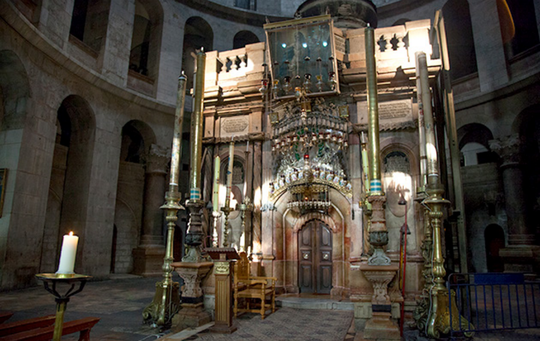
The Aedicule—a chapel that tradition says contains both Jesus’ tomb and the stone that sealed it—rests under a dome of the Church of the Holy Sepulchre in Jerusalem.

Christians embrace Jesus’ words to love God, neighbor and enemy, and to pray for those who persecute us. 11 Jesus, the Jewish teacher, says that on love of God and neighbor hang all the law, or Torah, and prophets. 12 As in all matters regarding a theology of land and chosenness, followers of Jesus are called to love all people, the Jewish neighbor as well as the Palestinian neighbor. 13