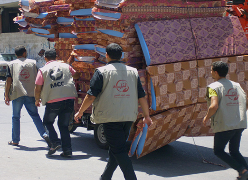
Volunteers wearing MCC and Al Najd Development Forum vests deliver mattresses to families who opened their homes to other Gazans displaced by the Israel-Hamas conflict in 2014. MCC provided bedding and related supplies distributed through partner organization Al Najd.

Gaza’s situation is particularly difficult. The Gaza Strip is 40 kilometers (25 miles) long and, at its widest point, 13 kilometers (8 miles) wide. Since 1994, Israel has enclosed Gaza with a fence on three sides and by control of the Mediterranean Sea on the west. In 2006, Palestine elected Hamas (an Islamist militant group) to govern, though ultimately their political leadership was confined to Gaza. Some voters favored an Islamic state,