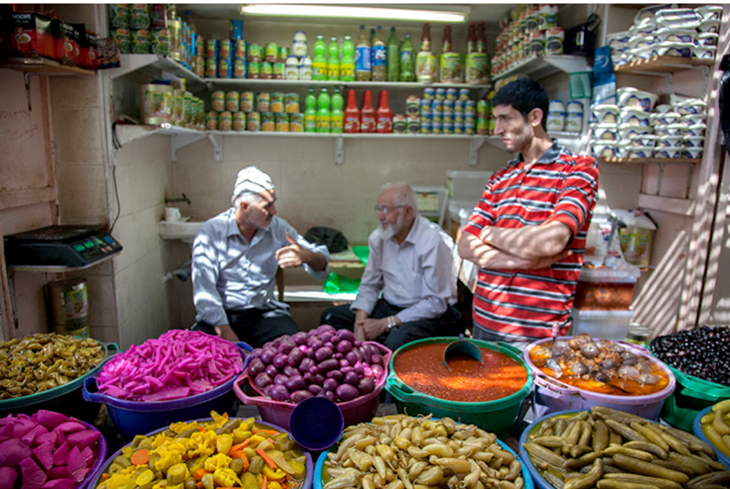
Vendors sell pickled vegetables and olives at a market in the city of Hebron.

Wherever we work, MCC is on the side of a just peace between societal groups or people in conflict. MCC does not choose one people group over another. “MCC does ‘take sides’ with the good news of Christ that reconciliation between enemies is possible and that reconciliation involves the doing of justice. MCC does ‘take sides’ against all forms of violence, regardless who perpetrates it.