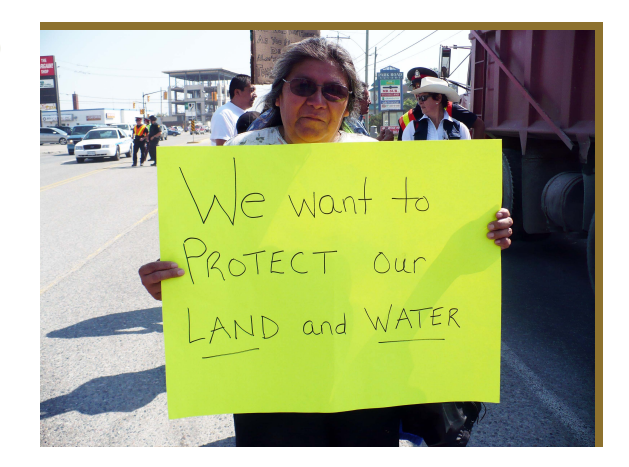
Nations in Ontario.