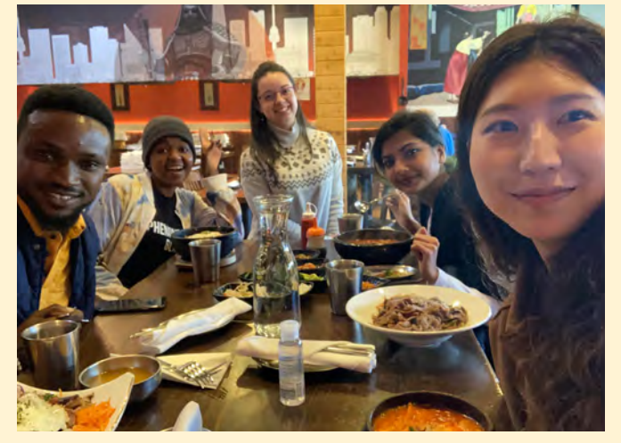
Central States and West Coast IVEPers enjoying Korean food together.