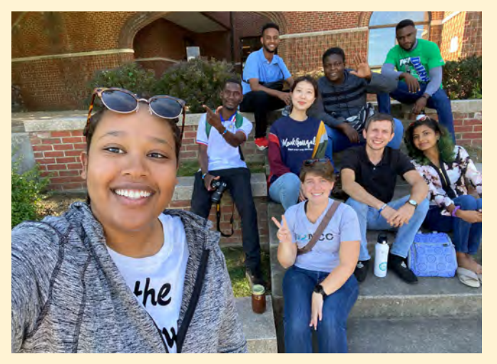
East Coast and Central States IVEPers and staff enjoy a break at Eastern Mennonite University.