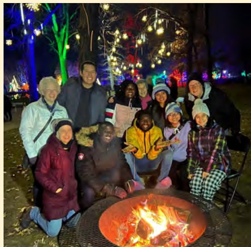
Enjoying a Christmas bonfire with Great Lakes IVEPers and friends.