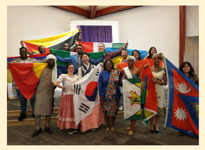
International Worship Festival in Goshen, IN.