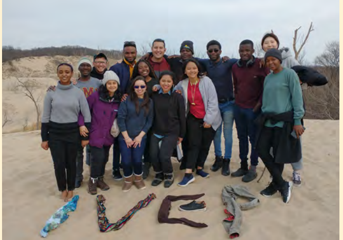
Enjoying Warren Dunes Park during mid-year conference.