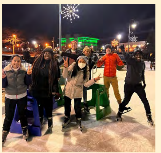
Great Lakes IVEPers try ice skating.