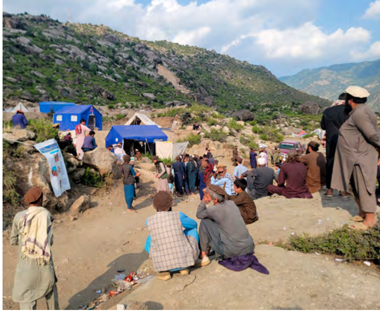
A man stands at his destroyed home (top left) and men wait at a cash distribution site (top right). Below, a 35-year-old mother signs for a cash distribution with her thumbprint.

Read more at mcc.org/afghanistan-update .