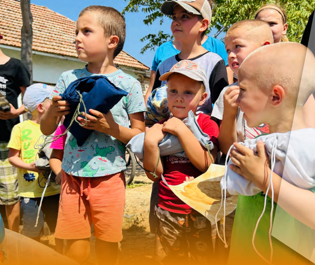
Children living in the Kherson region of Ukraine hold hygiene kits they received from MCC partner Association of Mennonite Brethren Churches of Ukraine.

“We see how dire the need is. We realize we can’t provide people with everything they need, but people are still grateful.”