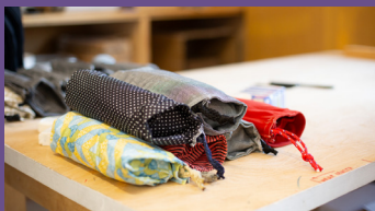
Hygiene kit packing at the MCC Alberta warehouse.