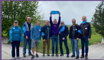
The Wheels of Waterton team preparing to cycle 100 km for GO!100.