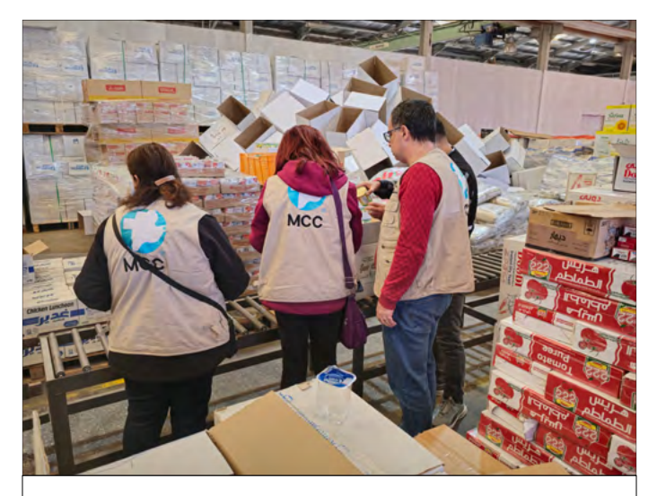
In Amman, Jordan, MCC and Jordan Hashemite Charity Organization staff inspect items from the initial shipment of 665 food packages for dispatch to Gaza.*

A woman walks by a pile of rubble left from the February 2023 earthquake along the streets of Jableh, a remote city in Latakia, Syria. Nearly 9,000 people received monthly food supplies from MCC partners after the earthquakes.*