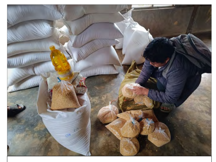
An MCC partner staff prepares food parcels for distribution to internally displaced people in Myanmar.*

Two women receive MCC comforters in the Zaporizhzhia region of Ukraine. Because of your support, more than 332,000 hungry people have been served meals, and more than 60,000 comforters have kept people warm.*