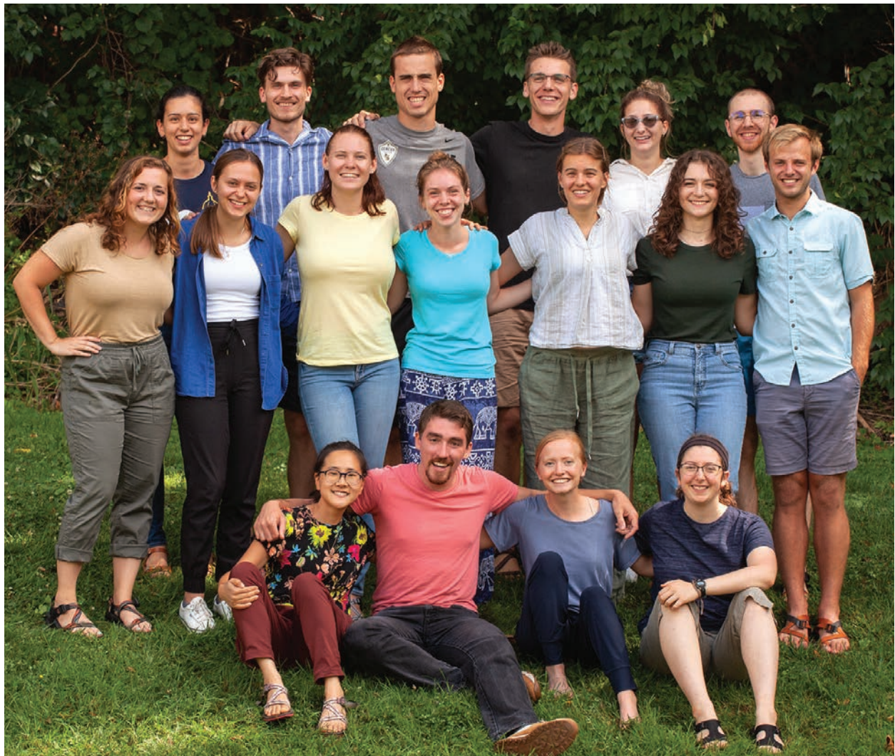
SALT orientation in Akron, Pennsylvania